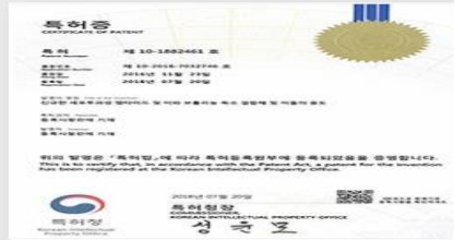
보툴리눔 독소 결합 기술 특허