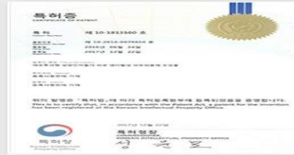
세포 투과성 펩타이드 및 결합체 특허