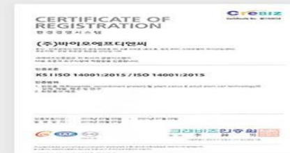
화장품 재료 및 설계 개발 연구 인증