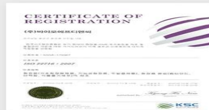
GMP 우수 화장품 제조 및 품질관리 인증