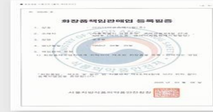
화장품 책임 판매업 등록필증