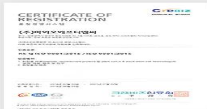
화장품 재료의 설계, 연구, 개발, 제조 적합 인증