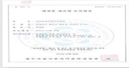
화장품 제조업 등록 필증