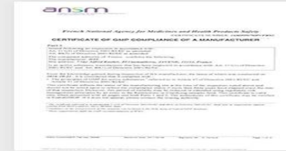
프랑스 HTL사 PDRN & HA - EU GMP 서류