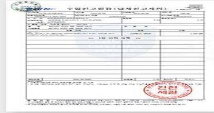
프랑스 수입 신고 필증